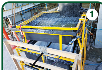
Wastewater is dispensed into the top hat lid above