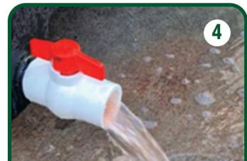
Clean water filters out from the tap below; trapping solids in the dewatering bag for easy disposal.