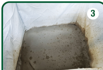
The treated waste is discharged into the dewatering bag.